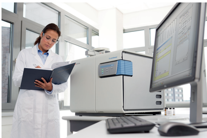
Figure 1. The Thermo Scientific FlashSmart Elemental Analyzer.