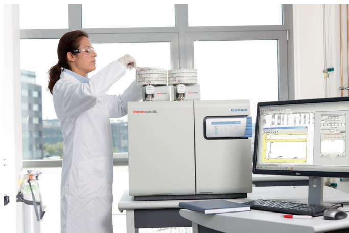
Figure 1. Thermo Scientific FlashSmart Elemental Analyzer.

Considering the need for cost efficiencies and the likely increase in helium gas cost, an alternative gas to be used as carrier gas is needed. Argon can be used as alternative to helium in the FlashSmart EA.