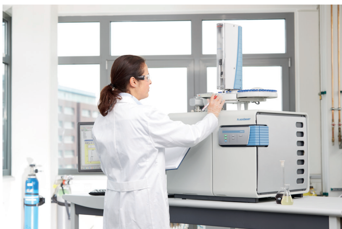
Figure 1. Thermo Scientific FlashSmart Elemental Analyzer.

As the demand for improved sample throughput, the reduction of operational costs and the minimization of human errors increases, a simple and automated technique allowing fast analysis with an excellent reproducibility is required. The Thermo Scientific™ FlashSmart™ Elemental Analyzer (Figure 1), based on dynamic combustion (modified Dumas method), requires no sample digestion or toxic chemicals, while providing important advantages in terms of time, automation and quantitative determination of nitrogen in large concentration. However, to prevent high operational cost, due to the shortage in helium, the FlashSmart Elemental Analyzer can work with an alternative gas, argon, which is readily available.