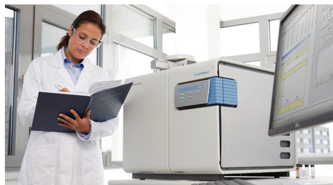
Figure 1. Thermo Scientific FlashSmart Elemental Analyzer.

A complete report is automatically generated by the Thermo Scientific™ EagerSmart™ Data Handling Software and displayed at the end of the analysis. The EagerSmart Data Handling Software provides a new option “AGO” (Argon Gas Option), which allows the modification of the argon carrier flow during the run.